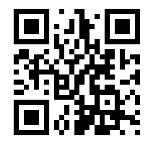
Visit our website at http://www.ligo.org/

Introduction to gravitational wave detectors: http://www.ligo.org/science/GW-IFO.php Introduction to gravitational waves from inspiraling binaries: http://www.ligo.org/science/GW-Inspiral.php Introduction to gravitational wave bursts: http://www.ligo.org/science/GW-Burst.php Advanced LIGO homepage: https://www.advancedligo.mit.edu/ Advanced Virgo homepage: https://www.cascina.virgo.infn.it/advirgo/